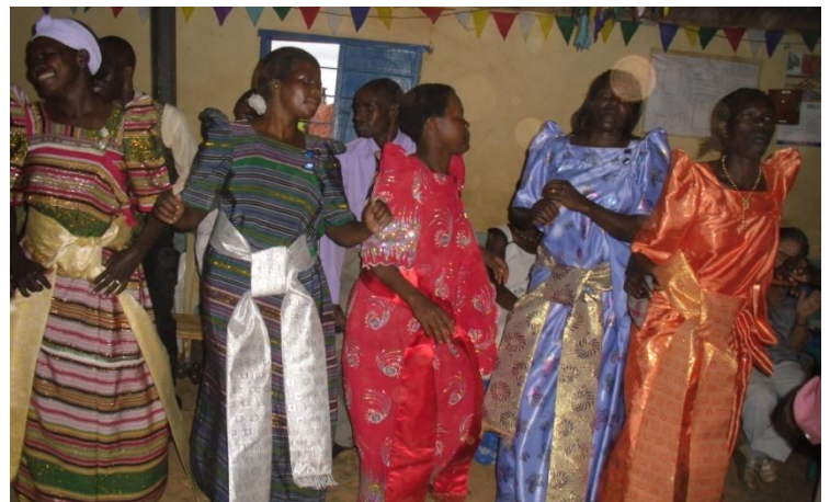
Joyful: One of the Praise sessions in a worship gathering