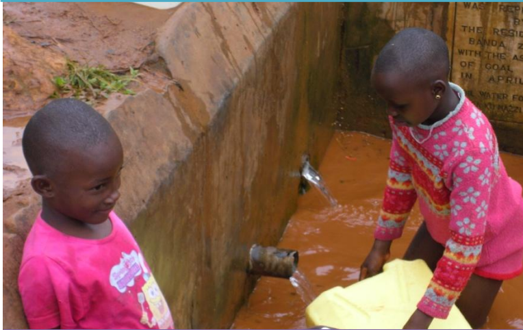
A Child fetching water from a community well

Most people in the sub-urban and rural parts of Uganda have no access to piped water in their homes. They, instead use communal well to access safe water and also do their laundry. Often times the wells [and other public facilities] are left uncared for due to poor local governance.