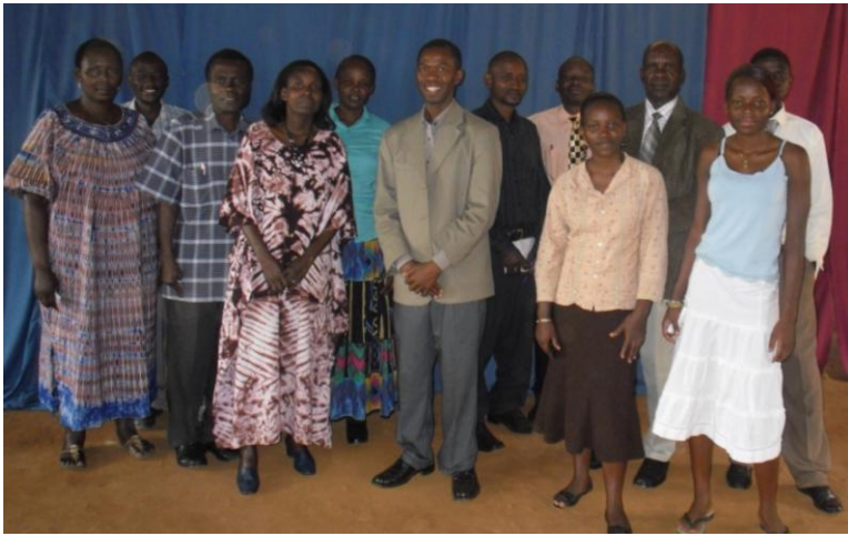
Part of our church leadership team poses for a photo after service.