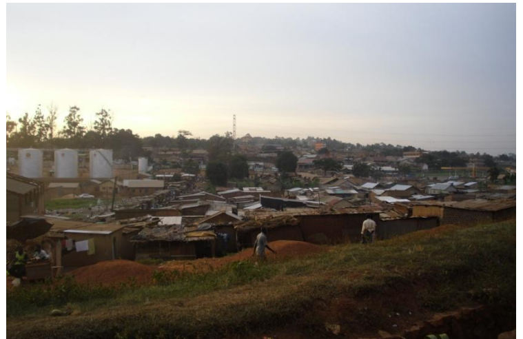
A slum in our church neighborhood. Kyambogo University is in the back ground