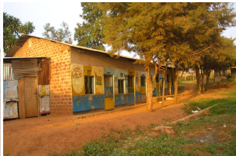
The front view of Tumaini Christian School