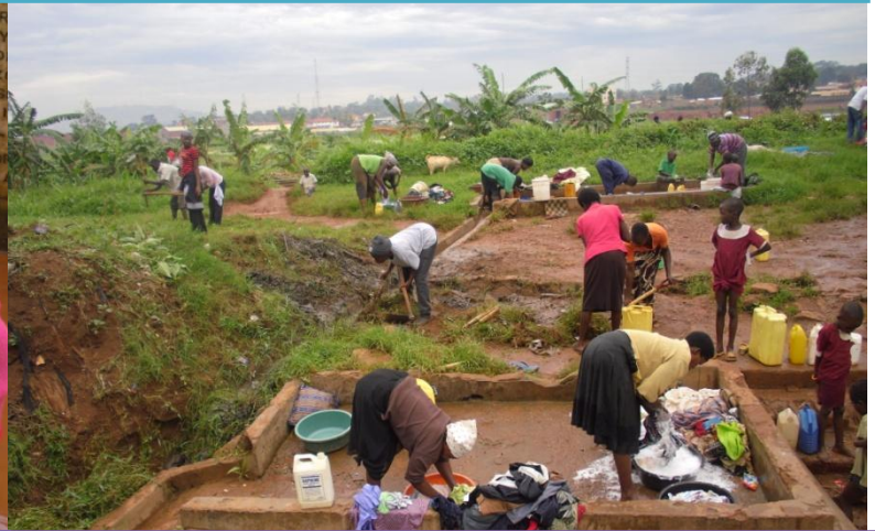
People from different households doing their laundry at the community well. In the Background the church members are cleaning the drainage channel for the well.

Such wells are a source of safe water for the community