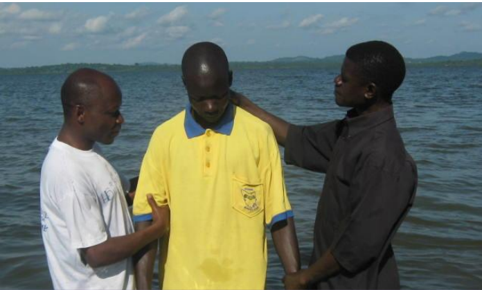
One of the baptism sessions when we welcome new believers into our church family