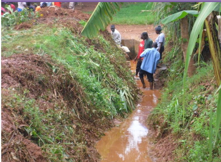
Church members clearing the water channel.

Due to poor maintenance sometimes the community wells become blocked with debris and overgrown grass thus blocking the water from flowing freely [see above picture]