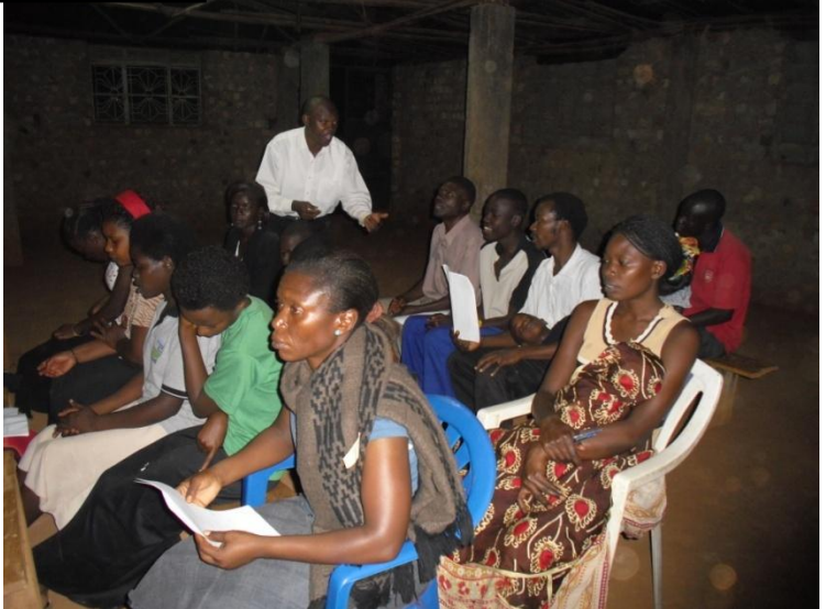
Our Church Choir during a practice session