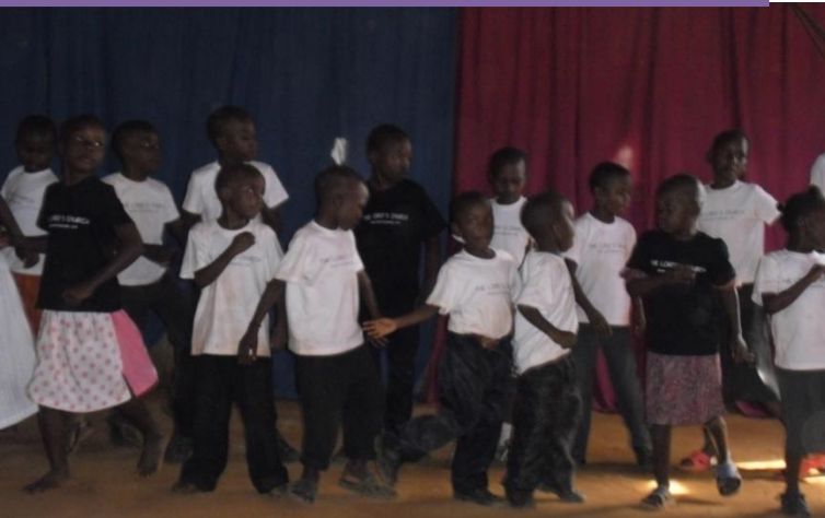
Children dancing in one of our worship gatherings. Children ministry is a core ministry in our church