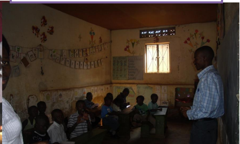
One of our Sunday School Sessions