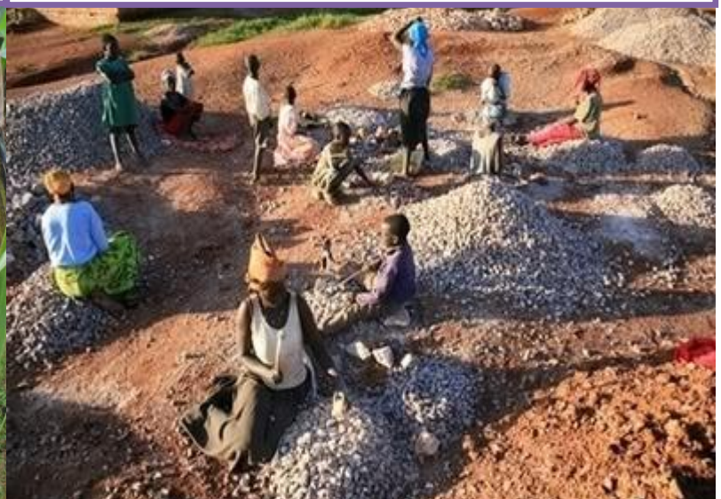
Women and some children working at the stone quarry.

Due to poor maintenance sometimes the community wells become blocked with debris and overgrown grass thus blocking the water from flowing freely [see above picture]