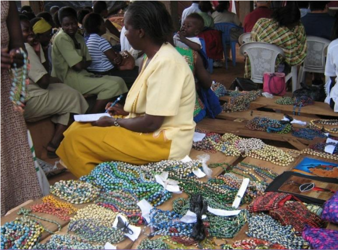
Paper Necklaces: One of the women projects in our church aims at boosting their family incomes