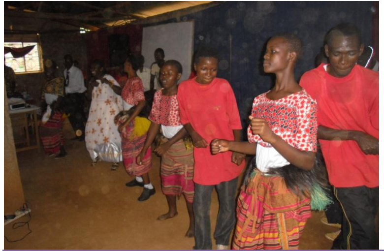
Dance for the Lord: A Youth group worshipping in an African Dance