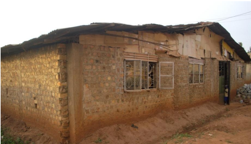
Our church building. It is planned to be a 3-storey facility. We have put a temporary roof as we raise more funds to continue the project