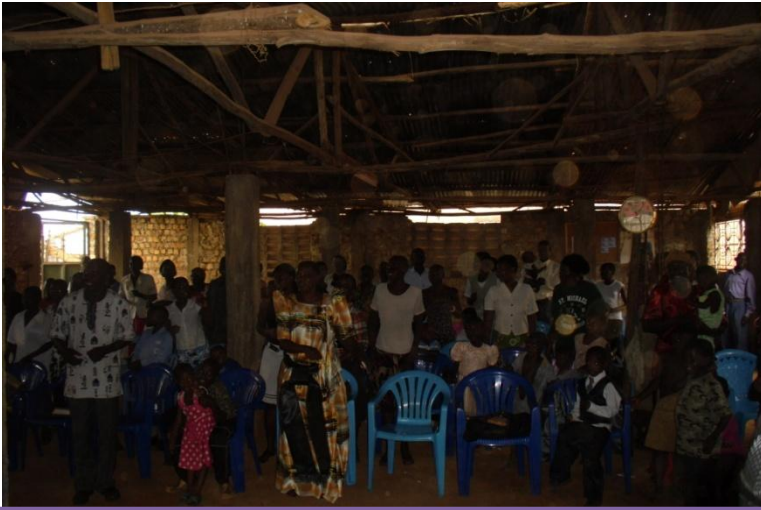
The congregation praising God during a Sunday worship gathering